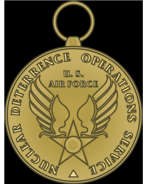
Eligibility for Nuclear Deterrence Operations Service Medal expands.

For more information, go to MyPers . Select "search all components" in the drop down menu and enter "NDOSM" in the search window. More information is also available on the Air Force Retiree