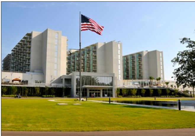
The Armed Forces Retirement Home in Gulfport, Mississippi, is one of two facilities providing residences and related services for certain retired and former service members

For further information or to request an application, visit https://www.afrh.gov/appl , email admissions@afrh.gov , or call 800-422-9988.