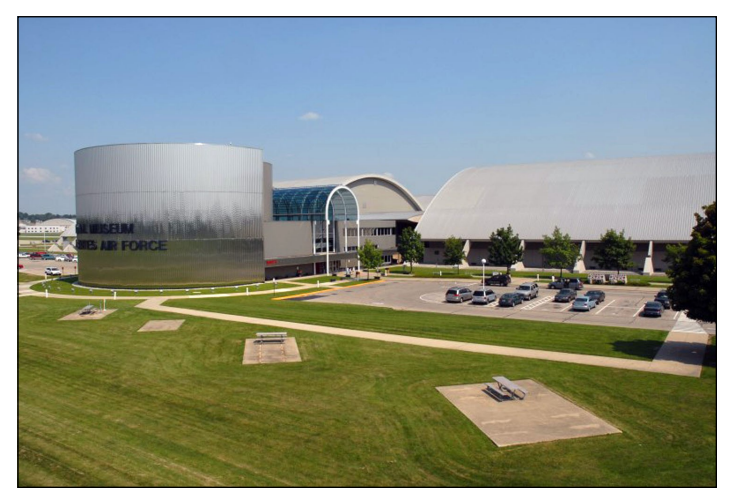
The National Museum of the U.S. Air Force is the service's national institution for preserving and presenting the Air Force story. (U.S. Air Force photo)

For more information, call 937-258-1218; send email to <a href="mailto:foundation@afmuseum.com">foundation@afmuseum.com</a>; or visit <a href="mailto:http://www.legacydataplates.com/">http://www.legacydataplates.com/</a>. (Courtesy of Air Force Museum Foundation website)