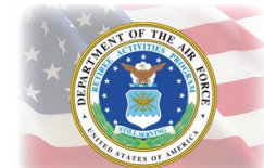
Retiree Activities Office

TORREJON Phone: 011-34-91-232-5907 Email: rao.torrejon@gmail.com